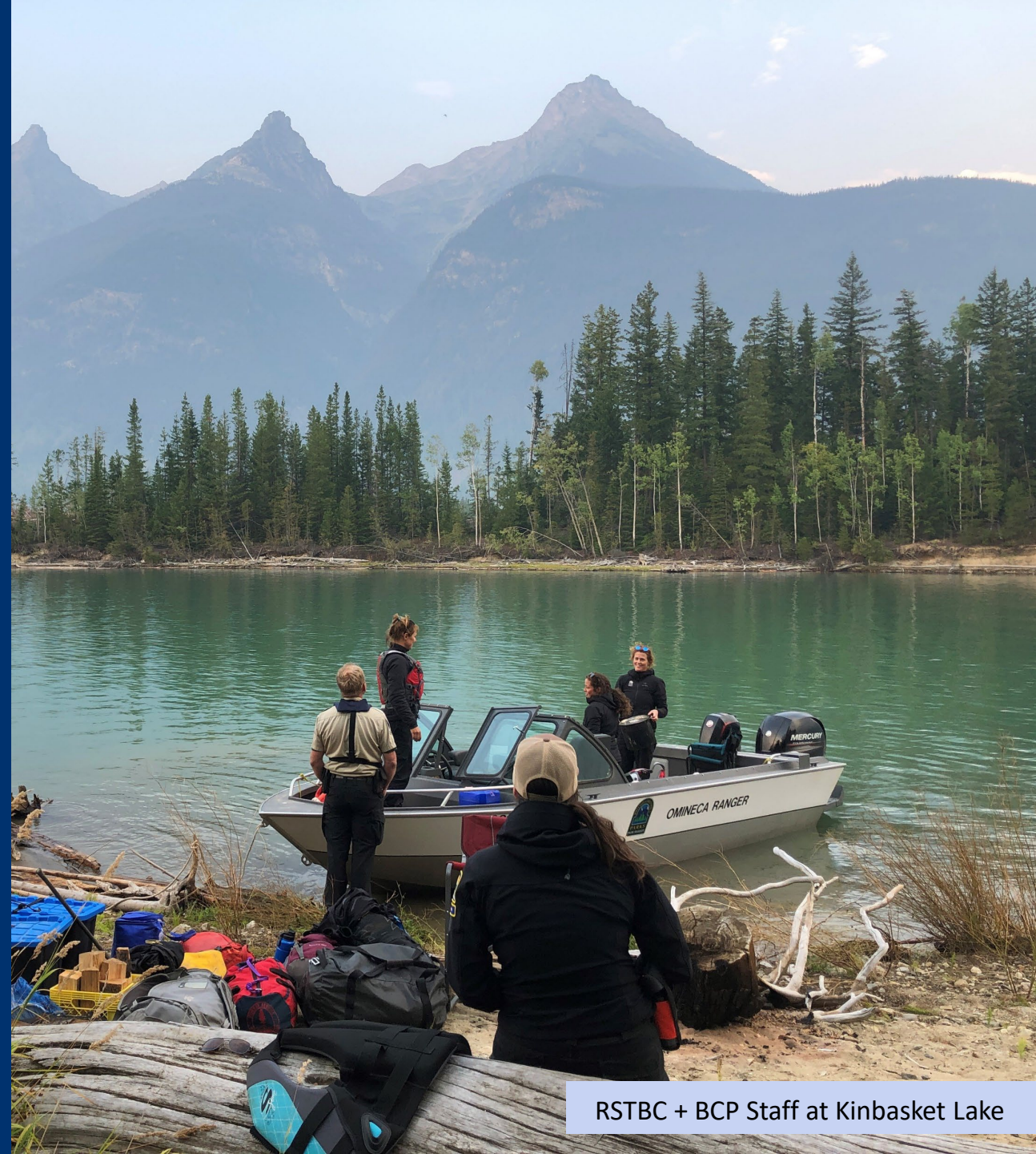
RSTBC + BCP Staff at Kinbasket Lake